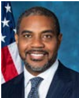
Representative Steven Horsford (D-NV)

Senator Peters won re-election in one of the most competitive and expensive races in the country. Peters' aggressive re-election campaign broke fundraising records in Michigan with more than $50 million raised for the 2020 cycle. He is a fifth-generation Michigander and a former Lieutenant Commander in the U.S. Navy Reserve who is consistently recognized as one of the most effective Senators in the Democratic caucus. He previously served in the House of Representatives and as a member of the Financial Services Committee. Senator Peters is the Chairman of the Senate Homeland Security and Governmental Affairs Committee.