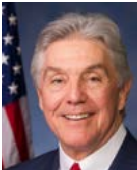
Representative Roger Williams (R-TX)

Congresswoman Terri A. Sewell is in her sixth term representing Alabama's 7th Congressional District. She is one of the first women elected to Congress from Alabama and is the first black woman to ever serve in the Alabama Congressional delegation. Congresswoman Sewell sits on the House Ways and Means Committee and brings to the committee more than 15 years of experience as a securities and public finance attorney. She is a member of the Congressional Black Caucus where she is Co-Chair of the Voting Rights Task Force. Congresswoman Sewell is also a member of the New Democrat Coalition; Co-Chair of the Congressional Voting Rights Caucus; Vice-Chair of the Congressional HBCU Caucus; and Co-Chair of the Rural Caucus.