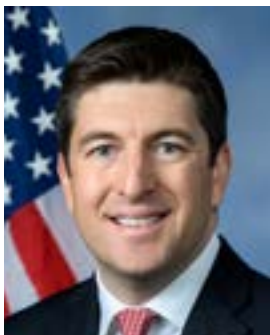
Representative Bryan Steil (R-WI)