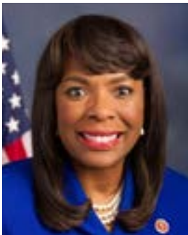
Representative Terri A. Sewell (D-AL)

In October, we hosted a four-part MORPAC Speaker Series Event: 2022 Midterm Elections Preview. We heard insightful updates from the Democratic Senatorial Campaign Committee (DSCC), National Republican Senatorial Committee (NRSC), Democratic Congressional Campaign Committee (DCCC), and National Republican Congressional Committee (NRCC). Each executive director covered targeted key house and senate races across the country and the possible impact these races would have on the 118th Congress.