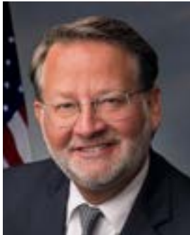
Senator Gary Peters (D-MI)