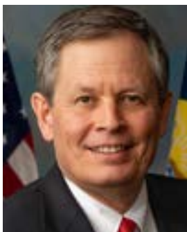
Senator Steve Daines (R-MT)

Congressman Bryan Steil was elected in 2018 and has earned a reputation for working hard for Wisconsin during his first terms in Congress. He currently serves on the House Financial Services Committee, which oversees all components of the nation's housing and financial services sectors. Congressman Steil is focused on making the American dream achievable for everyone. In 2023, Congressman Steil was appointed Chairman of the Committee on House Administration. He previously served as Ranking Member on the Elections Subcommittee and is focused on ensuring the House is open, secure, and accountable to the American people, and on strengthening Americans trust in our elections.